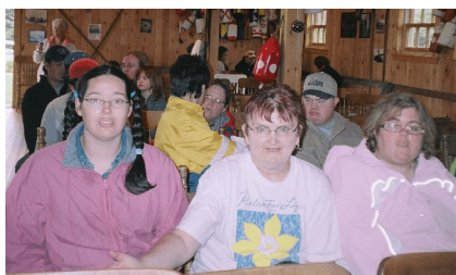
Some of our crew at Avonlea Village